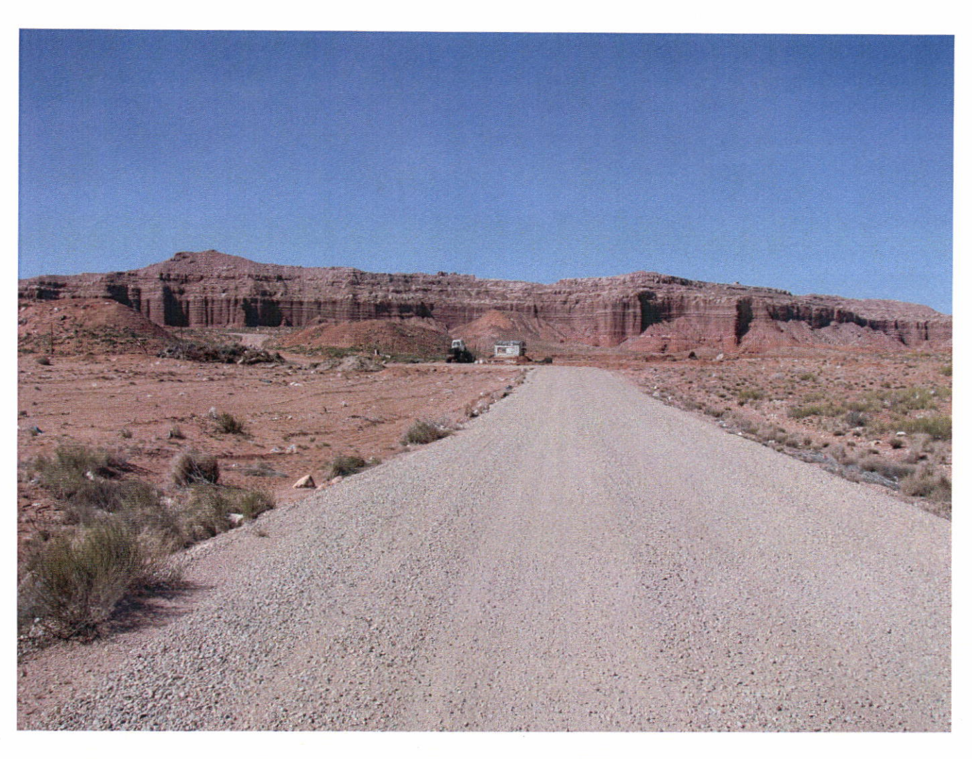
Looking west towards the old scale house