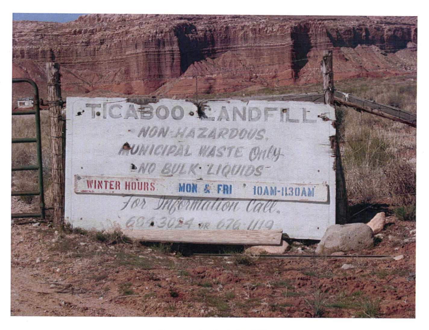
Entrance sign to the landfill