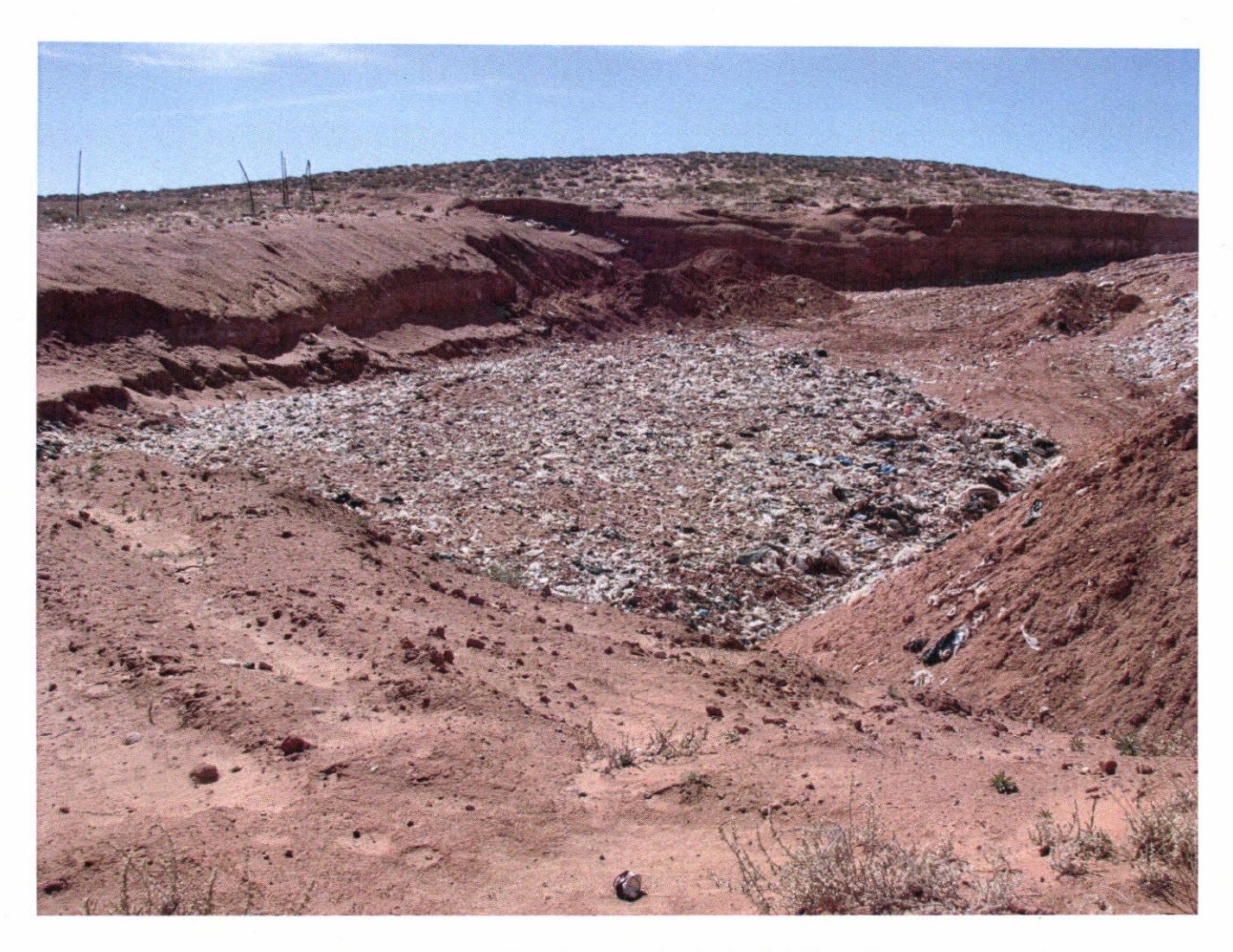
Looking at the working face and the lack of daily soil cover