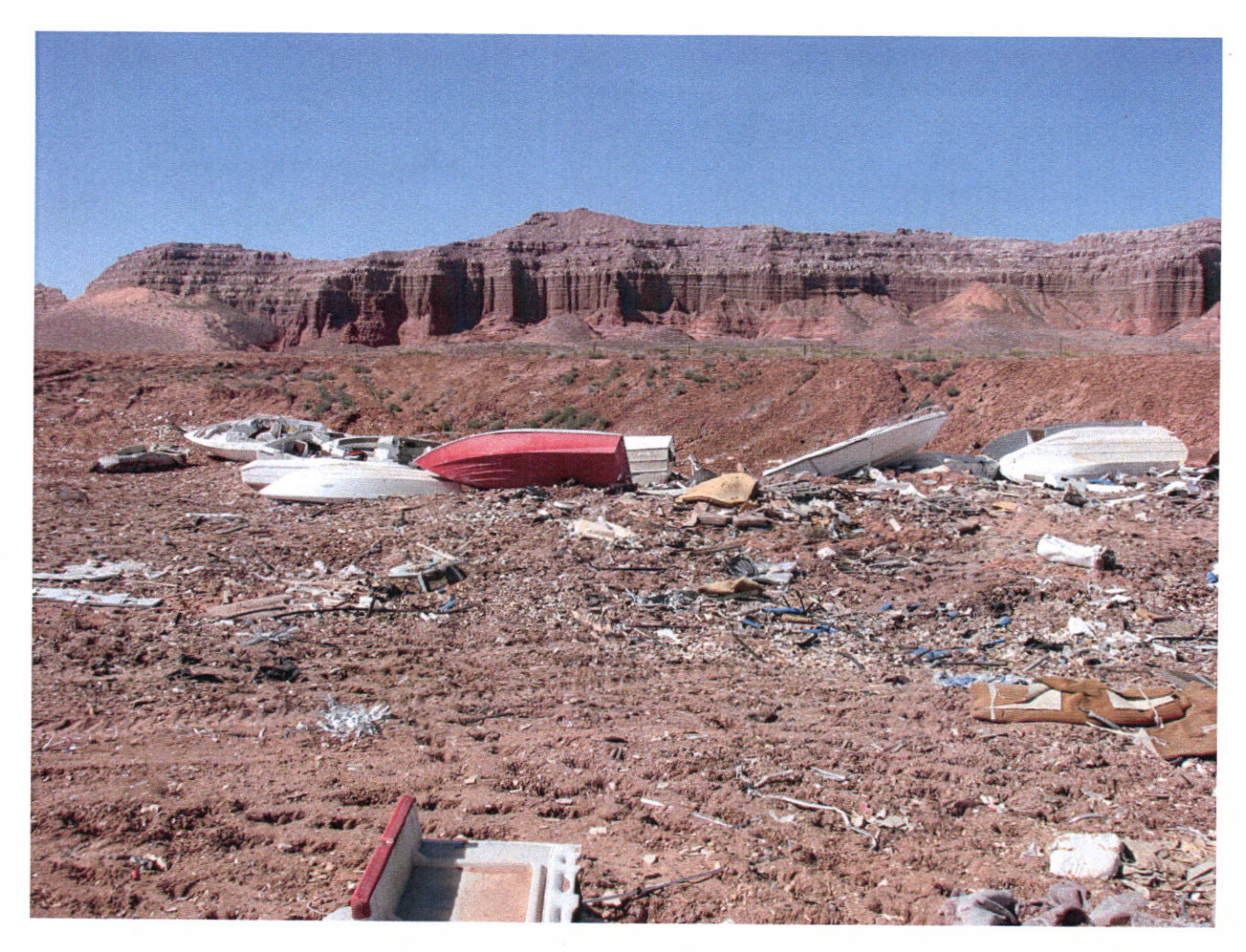
Looking west at the C&D waste cell. The boats, mattresses, furniture and other items that do not meet the definition of construction and demolition waste need to be removed and placed into the Class II MSW cell for final disposal.