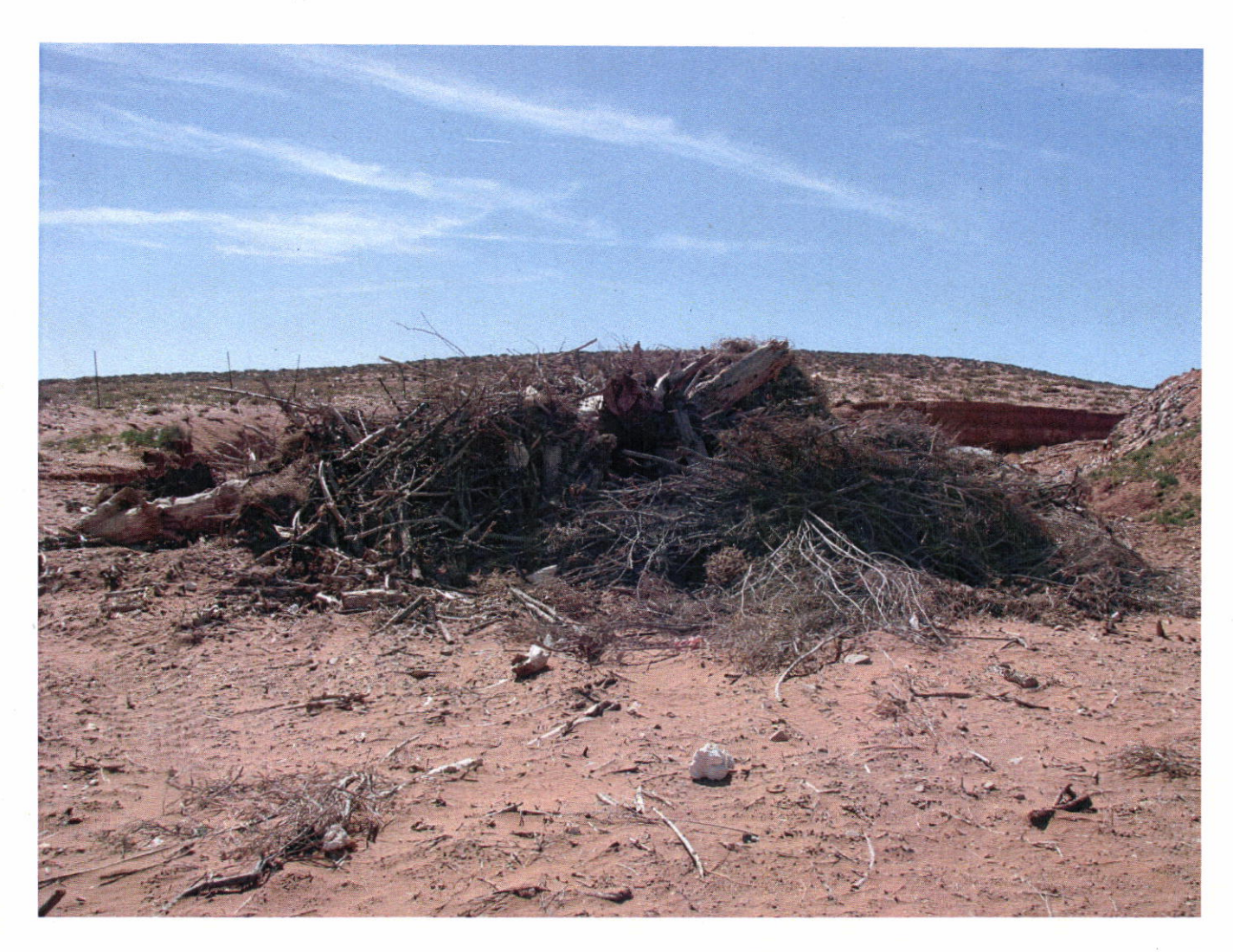
Green waste pile