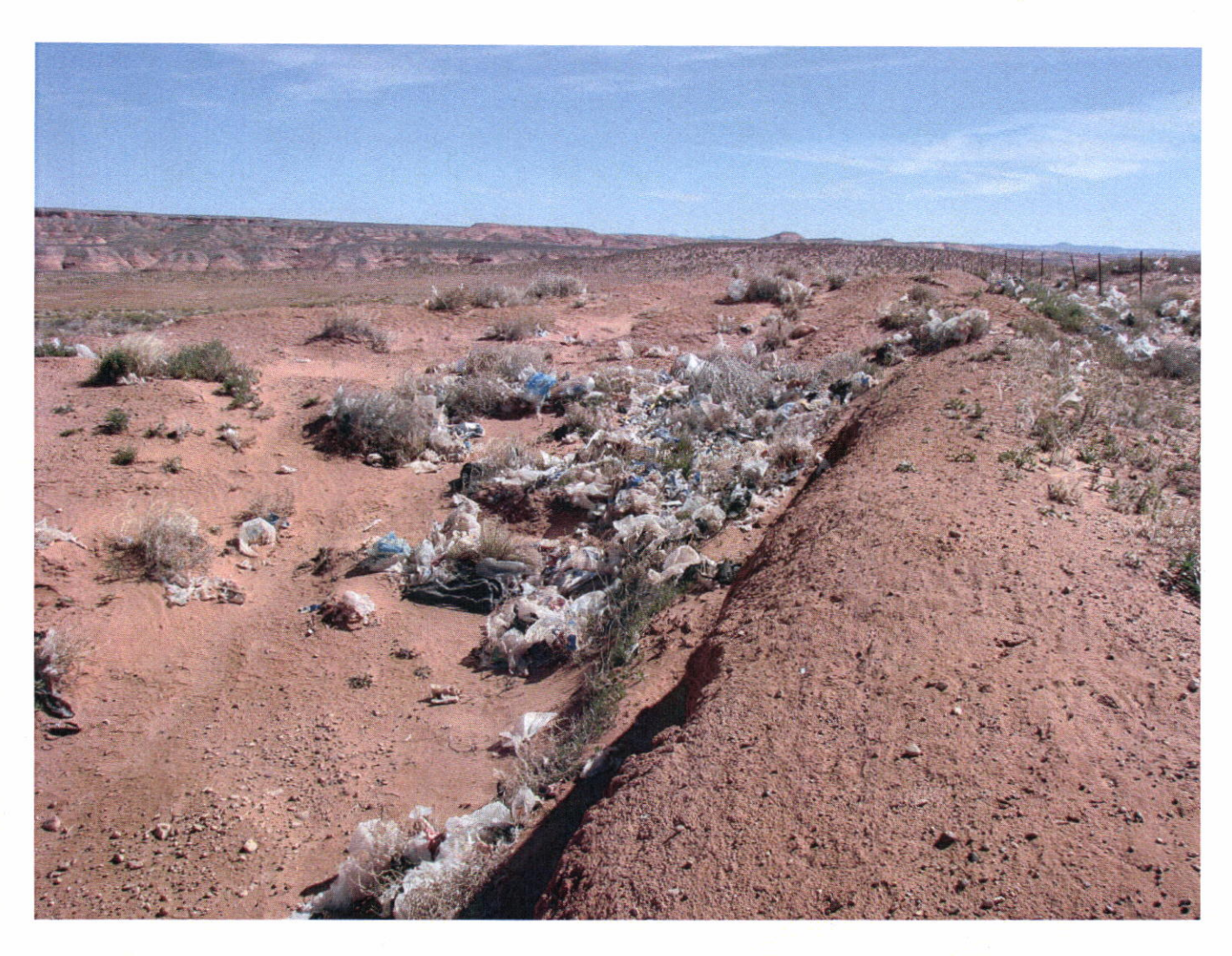
Litter along the south fence line that needs to be picked up and placed into the MSW cell.