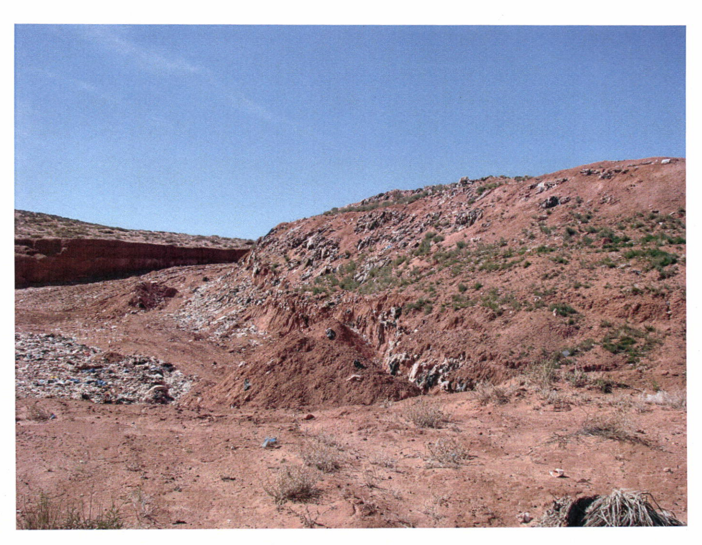
Looking south at the steep working face of the landfill