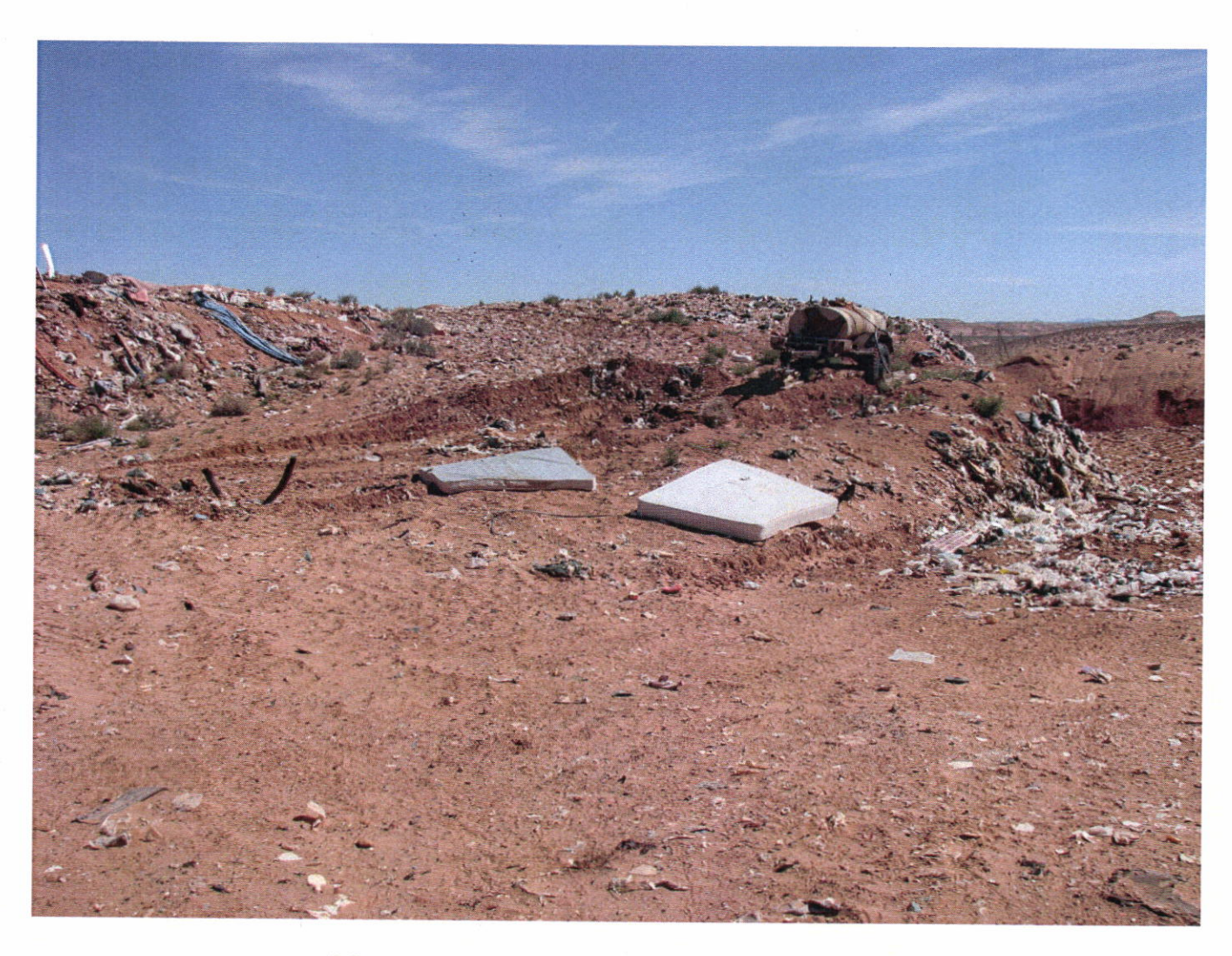
Mattresses that need to be compacted and covered.